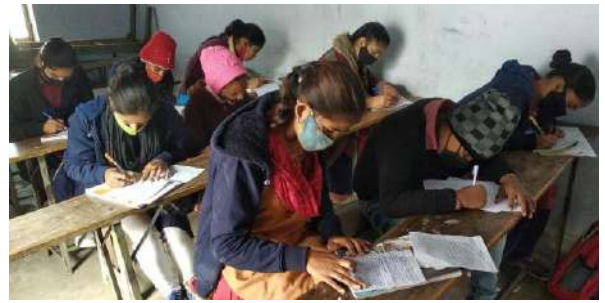
❖ Activities in pictures: