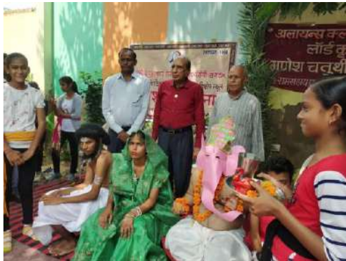
Ganesh Chaturthi with Alliance Club